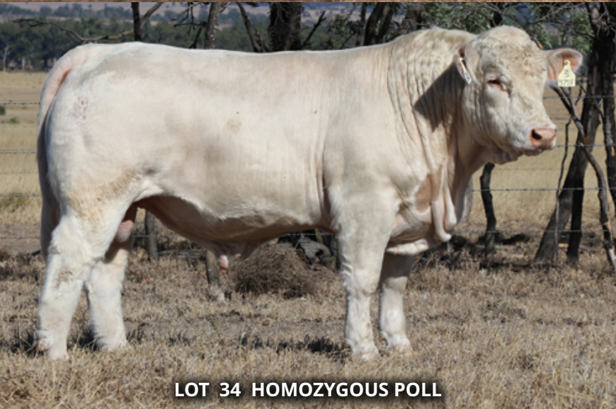
LOT 34 HOMOZYGOUS POLL