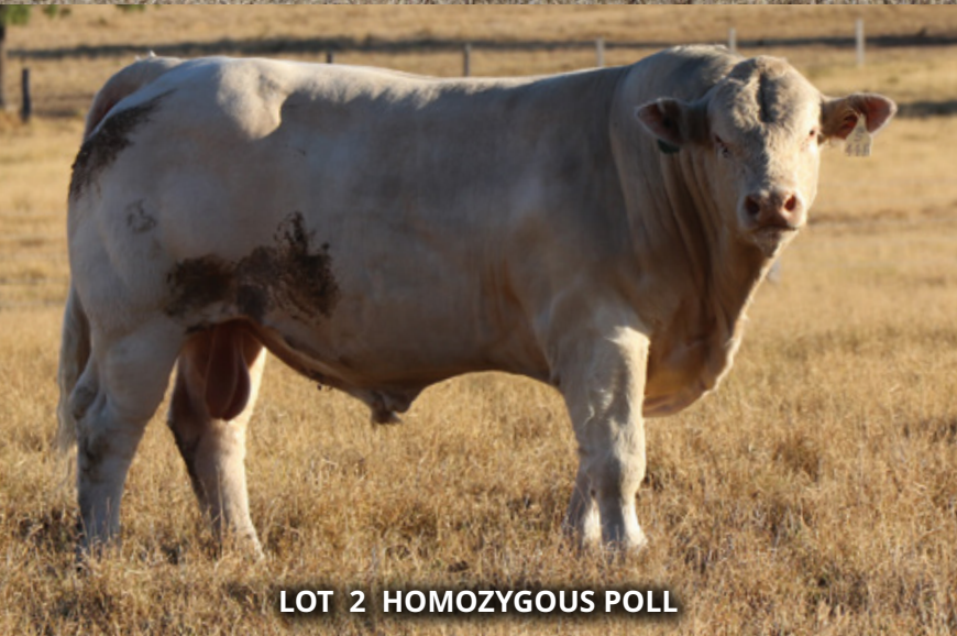
LOT 2 HOMOZYGOUS POLL