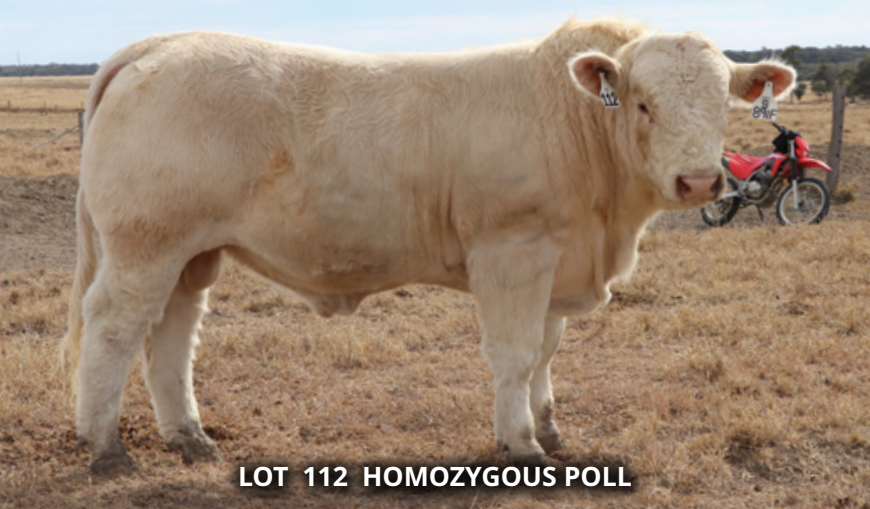
LOT 112 HOMOZYGOUS POLL