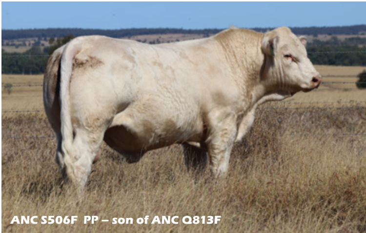
ANC S506F PP – son of ANC Q813F